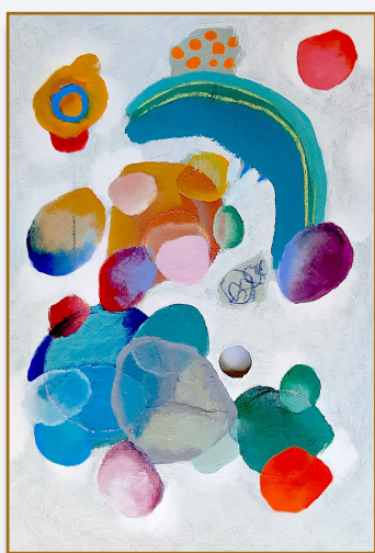
Forbidden Colors Acrylic and Oil on manipulated canvas 110x70cm 2020