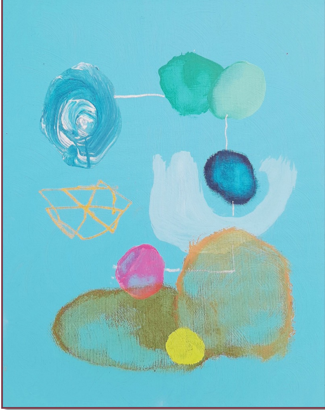
Fihi Ma Fihi Acrylic on canvas board 50x40 cm (DEC 2020)

GoogleTrends shows that for the past five years, the phrase It Is What It Is is being increasingly used by people and is usually an answer to a question that cannot be adequately answered, hence broadening its meaning.