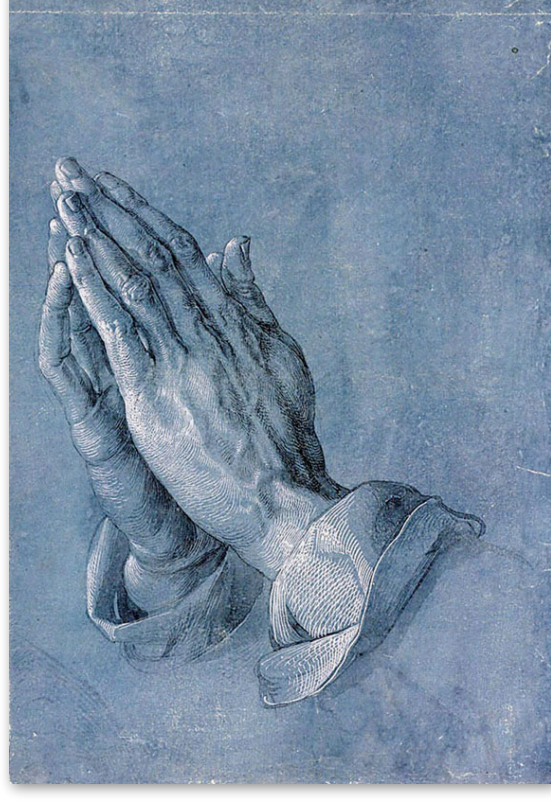
Praying Hands by Albrecht Dürer

As a kid, I received both Islamic and Christian teachings + practice. Simultaneously for some years, therefore things got mixed up with me because of the contradictions they intrinsically hold to each other. Yet here I am praying to no one and to everyone, asking for everything and remembering nothing.