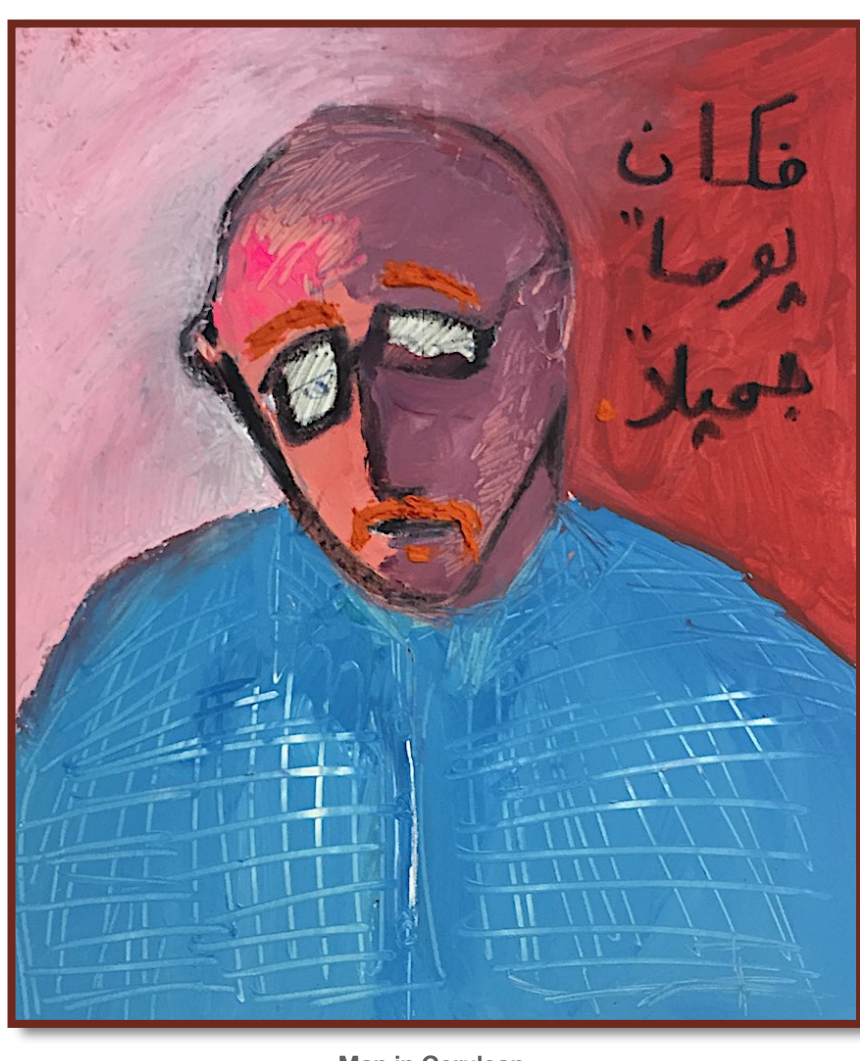
Man in Cerulean